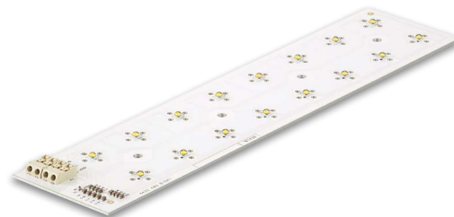
Fortimo FastFlex LED board 2x8 DS G3