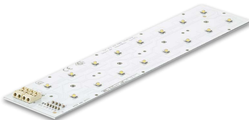
Fortimo FastFlex LED board 2x8 DA G3