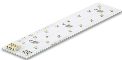
Fortimo FastFlex LED board 2x8 G3