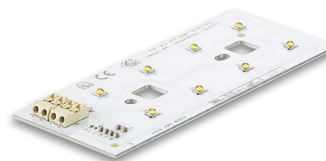
Fortimo FastFlex LED board 2x4 G3